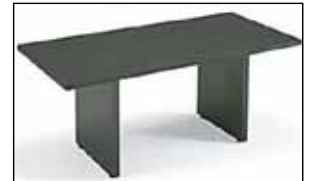
Straight Panel Base