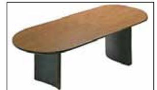
Racetrack Table with Curved Base