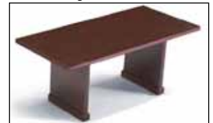
Traditional Panel Base in Mahogany or Walnut Only