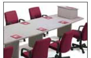
Boat Shape Table with Panel Base