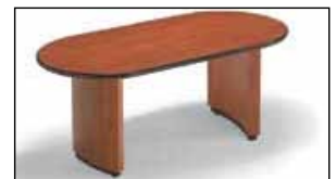
Racetrack Table with Plinth Base