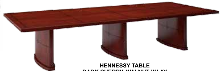
HENNESSY TABLE DARK CHERRY, WALNUT INLAY (F)