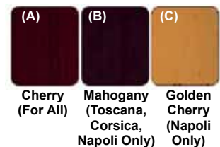
(A) Cherry (For All) (B) Mahogany (Toscana, Corsica, Napoli Only) (C) Golden Cherry (Napoli Only)