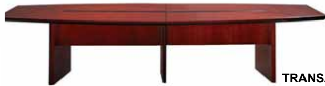
CORSICA BOAT STYLE CHERRY SHOWN (A) (B)

More contemporary BOAT style with 2" thick table top, and black beveled edge. Cherry or Mahogany Veneer. Built in cable management panel in table center, flush to top, with removable steel cover with grommet entry.