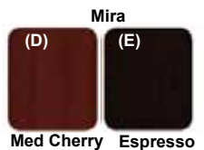
Med Cherry Espresso