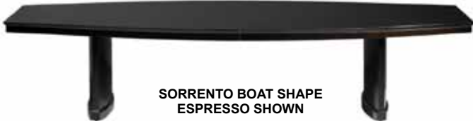
SORRENTO BOAT SHAPE ESPRESSO SHOWN