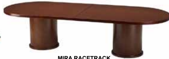
MIRA RACETRACK MEDIUM CHERRY SHOWN (D) (E)