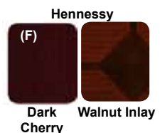
Dark Cherry Walnut Inlay