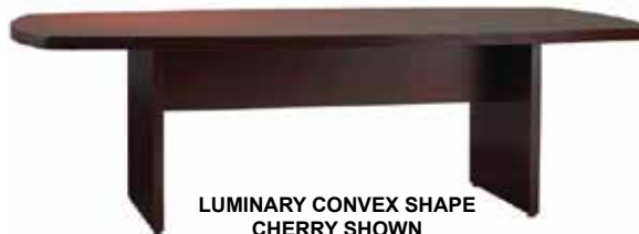
LUMINARY CONVEX SHAPE CHERRY SHOWN (C) (B)

Luminary is a complete series that includes an assortment of desk configurations (bow front, straight front, peninsula top), lateral files, bookcases, reception stations, white boards etc. allowing you flexibility and choices. Luminary features top grade North American maple and cherry veneers. Reeded edge detail. 3mm hardwood edges. 1.5" table top thickness.