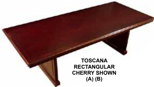
TOSCANA RECTANGULAR CHERRY SHOWN (A) (B)

Traditional RECTANGULAR Conference Table in Cherry or Mahogany Veneer, picture frame molding on external side of outside bases, base build-up and 2" H solid wood traditional style edge apron.