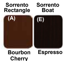
Bourbon Cherry Espresso