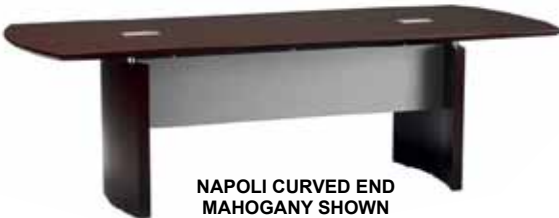
NAPOLI CURVED END MAHOGANY SHOWN (A) (B) (C)

Modern CURVED END Table with built-in grommets in the right size for the Power Module Option. Curved bases to match. 1 1/4" thick with beveled edge. Steel connecting plates on all multi-piece tops. Full modesty between all base panels. Power Module includes 2 power plugs, voice and data jacks.