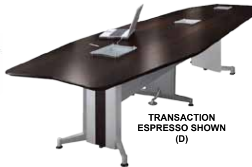
TRANSACTION ESPRESSO SHOWN (D)