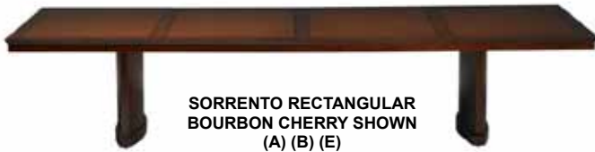
SORRENTO RECTANGULAR BOURBON CHERRY SHOWN (A) (B) (E)

Hennessy conference tables are unmatched in the industry when factoring beauty, craftsmanship, and affordability. hand-selected North American Cherry Veneers combine with intricate Walnut inlays in a Dark Cherry finish creating a stunning result. Complimenting the extensive offering of tables are a selection of buffets, credenzas, and presentation board. Bases also feature base build-up.